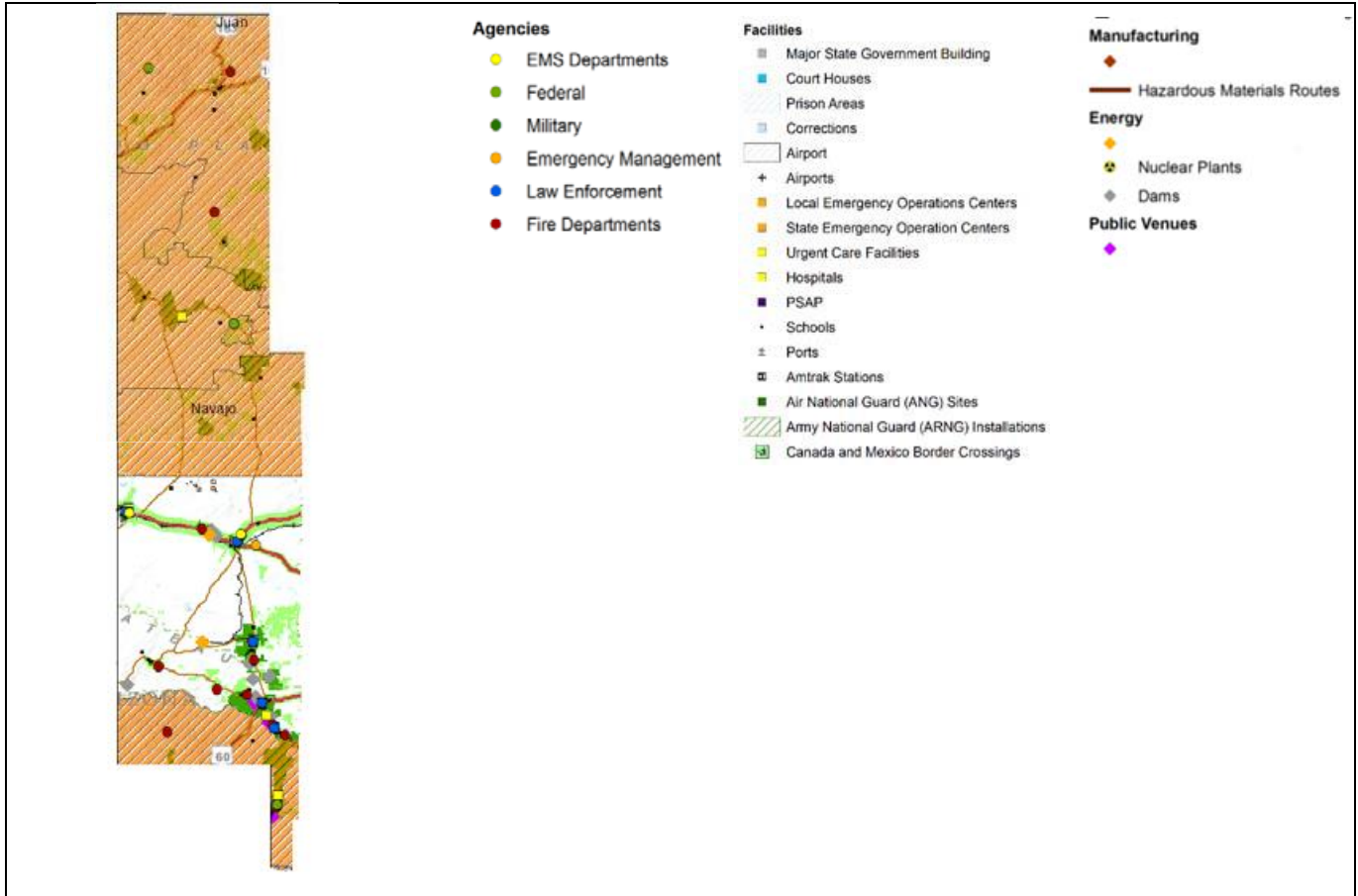
Figure 3 – Navajo County Infrastructure 12