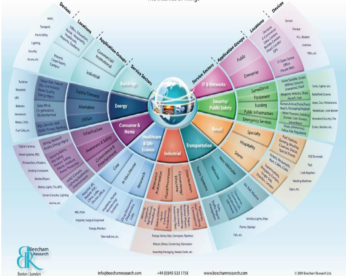
Figure 1 – Internet of Things