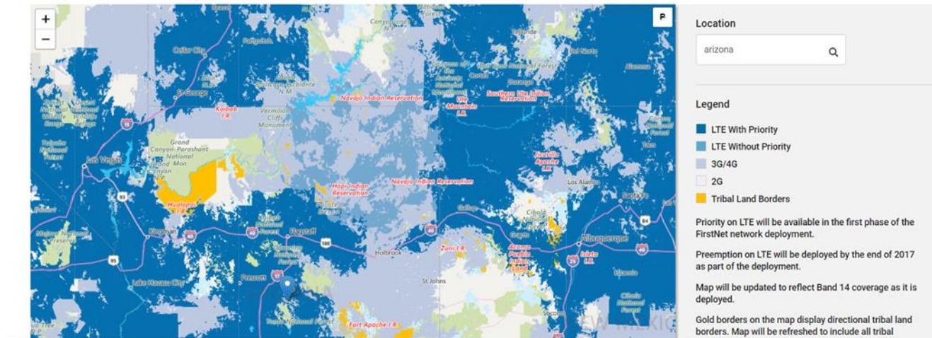
Figure 4 – Navajo County Current AT&T Network Coverage 13