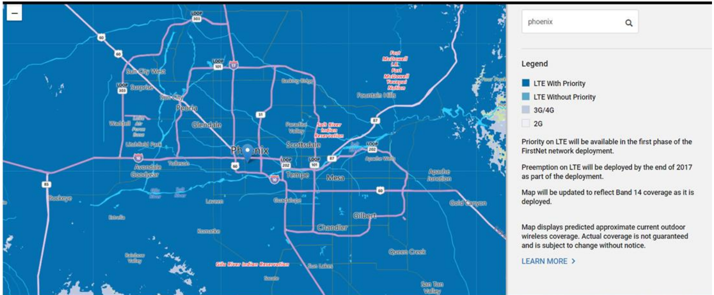
Figure 4 – Maricopa County Current AT&T Network Coverage 13