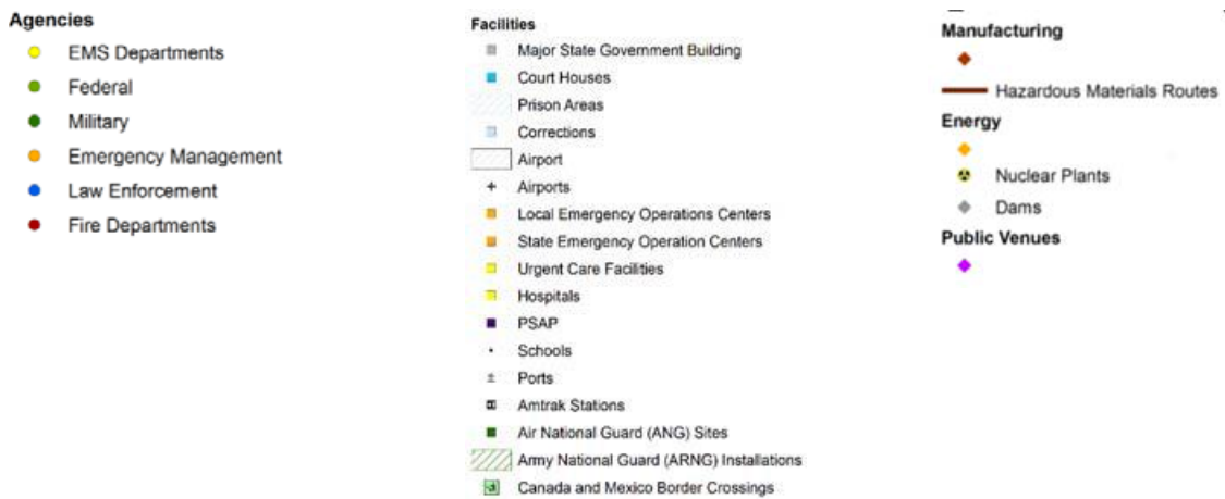
Figure 3 – Maricopa County Infrastructure 12