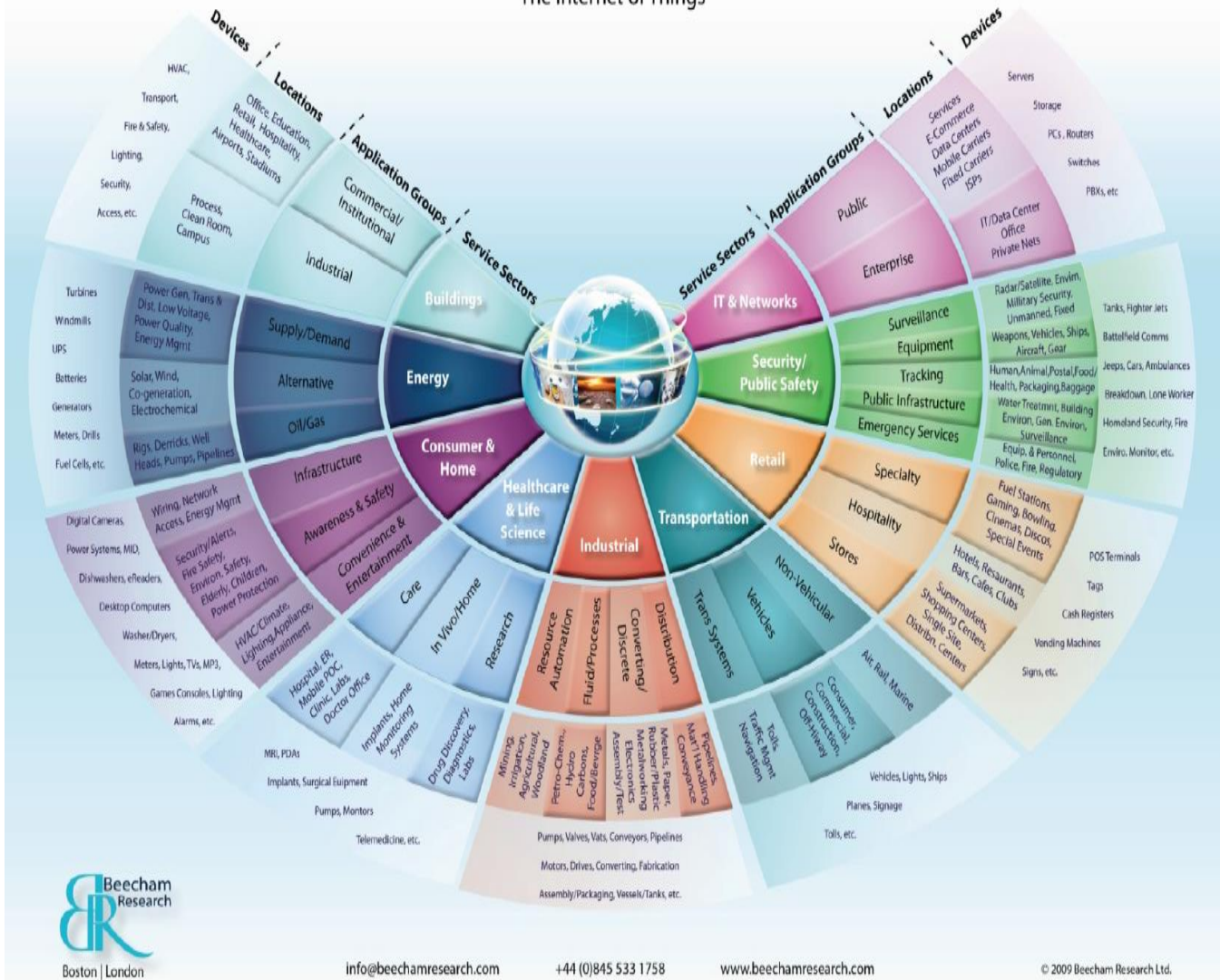
Figure 1 – Internet of Things