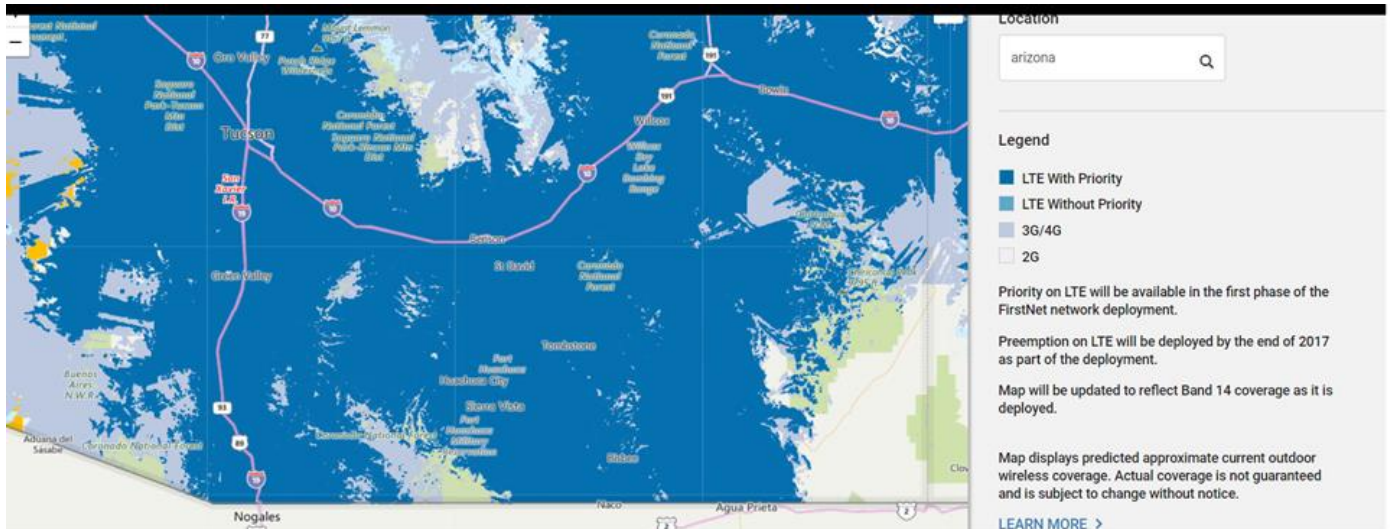
Figure 4 – Cochise County Current AT&T Network Coverage 13