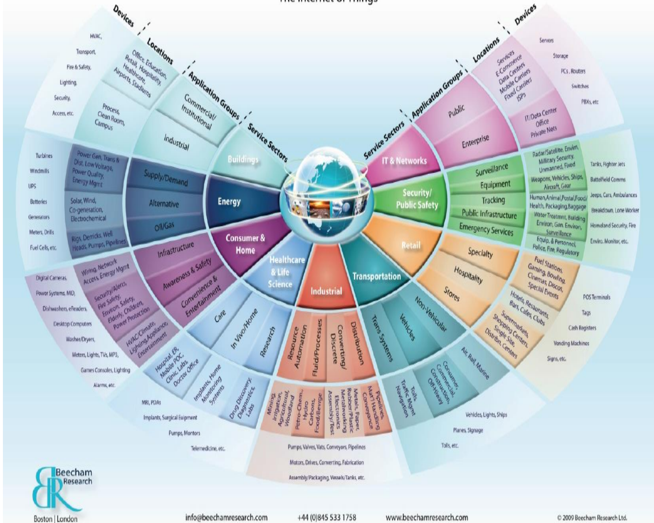
Figure 1 – Internet of Things