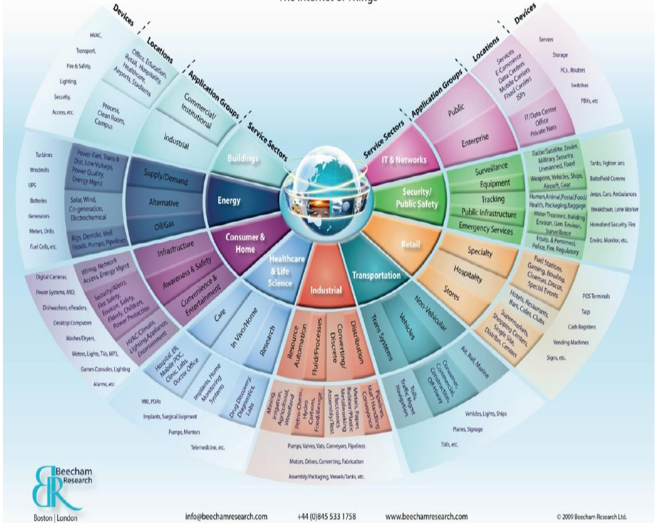
Figure 1 – Internet of Things