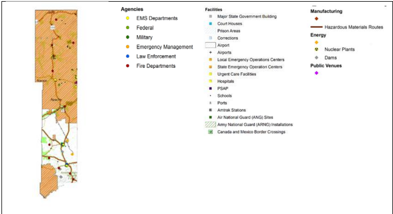
Figure 3 – Apache County Infrastructure 12